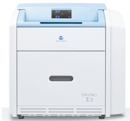
Konica Minolta DRYPRO Sigma II

With DRYPRO Sigma II, create images with unrivaled clarity and sharpness. Konica Minolta brings to you the latest precision optics which produce a 50 µm pixel pitch, for general radiography and mammography needs. Powerful image-processing algorithms are used to simultaneously optimize image smoothness and text sharpness. Diagnostic clarity is preserved and patient data is always legible, regardless of the print size.